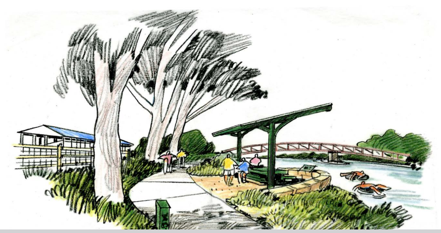
Recreational Opportunities along the North Platte River

CASPER WILL BE COMPRISED OF CREATIVE, SAFE, FAMILY-FRIENDLY NEIGHBORHOODS AND GATHERING AREAS WHERE ALL RESIDENTS AND VISITORS CAN ENJOY RICH CULTURE, STUNNING VISTAS, VAST OPEN SPACES, RECREATIONAL OPPORTUNITIES, AND BIG CITY AMENITIES.